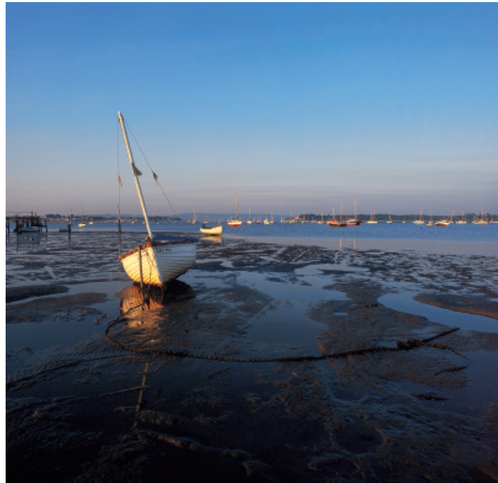
Boats in Poole Harbour.