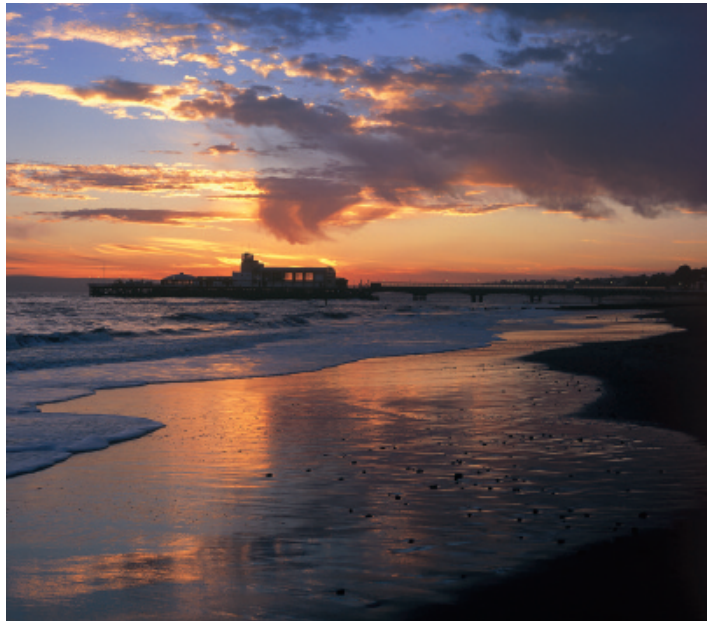
Bournemouth Pier at sunset.